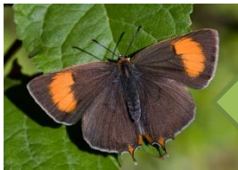
BROWN HAIRSTREAK Blackthorn

Medium, brown but looks orangey in flight around uncut blackthorn. More likely closer to Oxford.