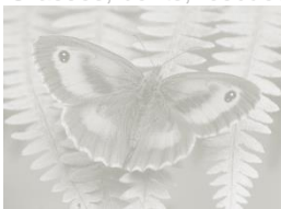
GATEKEEPER Grasses, bents, fescues

Orange with brown. 2 white dots in black circle.