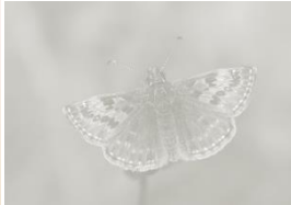
DINGY SKIPPER Vetches and trefoils

Very rare. Small, brown, indistinct markings