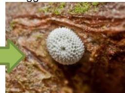
BROWN HAIRSTREAK Egg on Blackthorn

Tiny white egg, usually at join with new growth or thorn. Search Blackthorn in winter.