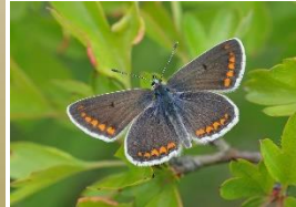
BROWN ARGUS Geranium/Cranesbill

Small, Brown with strong orange 'lozenges' on all wing edges