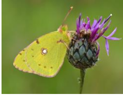
CLOUDED YELLOW Clovers, nectar-sources

Uncommon migrant. Looks golden in flight with black wing tips.