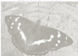
PURPLE EMPEROR Sallows in sun

Very big. Flies at top of canopy. Mud-puddles.