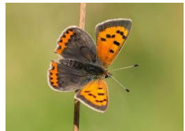
SMALL COPPER Sorrel and Dock

Small & striking. Orange forewing, brown hindwing