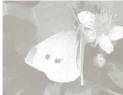
SMALL WHITE Various Crucifers

Grey/black marks/smudges at the wing tips, don't extend along outer edge.