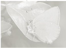
GREEN HAIRSTREAK Rockrose, Gorse, Broom

Our only green butterfly. Perches with wings closed on shrubs