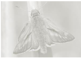
LARGE SKIPPER Cock's-foot

Orange w/lighter squares. Roosts on tall scrub & twigs.