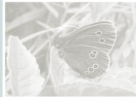
RINGLET Lush Grasses

Dark with white border. Underneath it has white ringed eyes. On scrub.