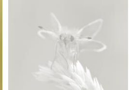
ESSEX SKIPPER Cock's-foot

Tiny, orange, triangular. Very similar to Small Skipper. Underside of Antennae tips are jet black