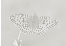
DARK GREEN FRITILLARY Dog-violet

Large, orange & black, white dots on underside. On chalk grass w/scrub. Unusual to find in this landscape.