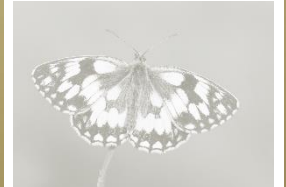
MARBLED WHITE Red fescue

Large butterfly. Black & white chequerboard pattern