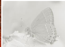
BLACK HAIRSTREAK Blackthorn

Rare. Small. Black dots in orange border. Woodland edges, hedgerows & thickets.