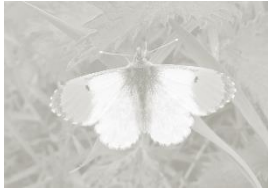
ORANGE-TIP on Ladies Smock, Garlic Mustard

Wing-tips are rounded - orange for the male, grey for the female. Both have blotchy green 'camouflage' underside.