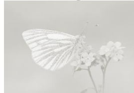
GREEN-VEINED WHITE Garlic & Hedge Mustard

Damp, lush areas. Similar to other whites but has streaked, greeny-grey lines on underside.