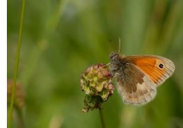
SMALL HEATH Fine grasses, fescues

Very small. Dusty, orange w/ rounded wings. Always rests with wings closed and short white streak always visible.