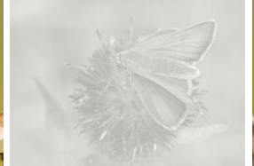
SMALL SKIPPER Yorkshire-fog

Tiny, orange, triangular. Very similar to Essex Skipper. Underside of antennae tips are orange