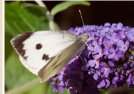
LARGE WHITE Various Crucifers

Largest black marks at wing tips, continuing along the outer edge. in an unbroken, L shape