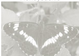
WHITE ADMIRAL Honeysuckle